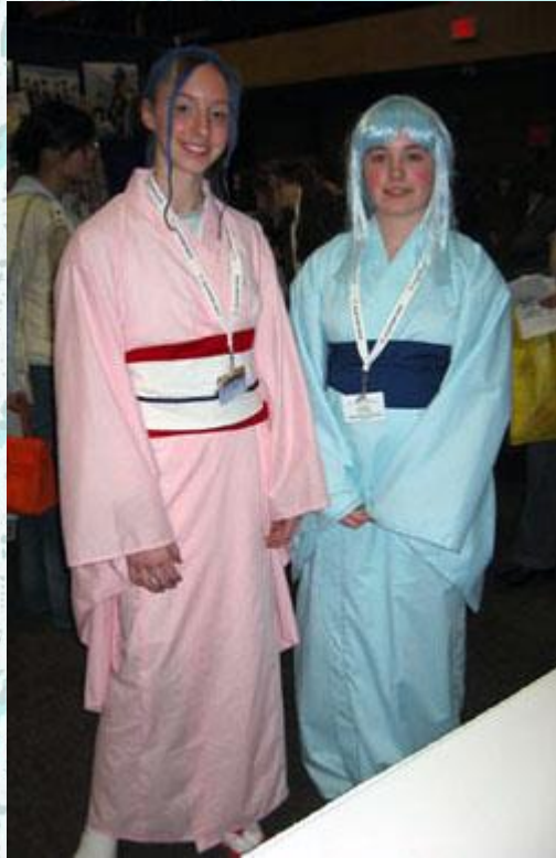
Botan and Yukina Anime Boston 2004

We wanted to keep the original colors and theme of the kimono, but branch into a Lolita/fashionista aesthetic.